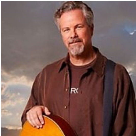
Robert Earl Keen